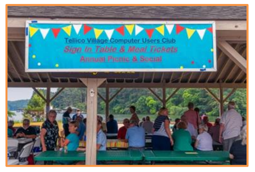
TVCUC Annual Picnic set for June 2, 2020

Keep up with latest club news and events by visiting our website. You can find us at https://www.tvcuc.org. See below for upcoming meetings and tour events.